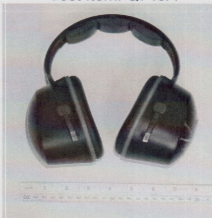
Test Item: Q749A

These data were obtained through measurements made at the laboratories of Michael & Associates, Inc., State College, PA , USA. Michael & Associates, Inc., is accredited to test to ANSI S3.19-1974 and ANSI S12.6-1997 by the National Institute of Standards and Technology (NIST) National Voluntary Laboratory Accreditation Program (NVLAP).