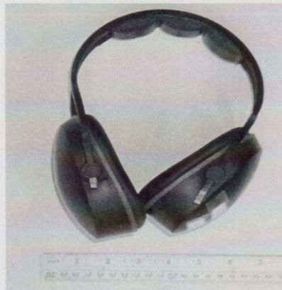
Test Item: Q742A

These data were obtained through measurements made at the laboratories of Michael & Associates, Inc., State College, PA, USA. Michael & Associates, Inc., is accredited to test to ANSI S3.19-1974 and ANSI S12.6-1997 by the National Institute of Standards and Technology (NIST) National Voluntary Laboratory Accreditation Program (NVLAP).